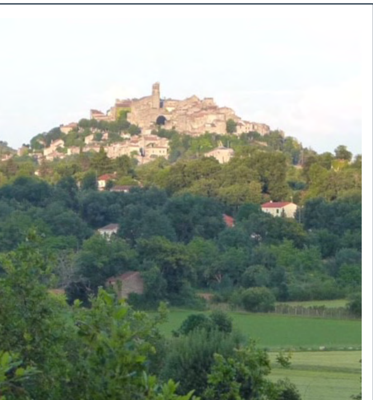
Hilltop village near to their home.