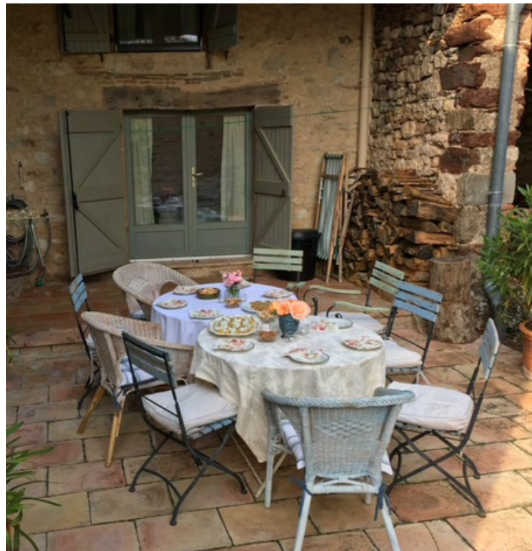
Courtyard of French home.