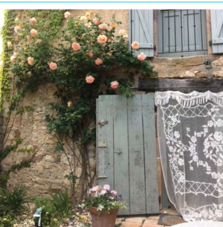
French home, front entrance.